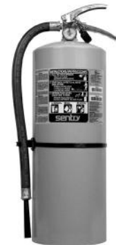
SENTRY 10 LB EXTINGUISHER